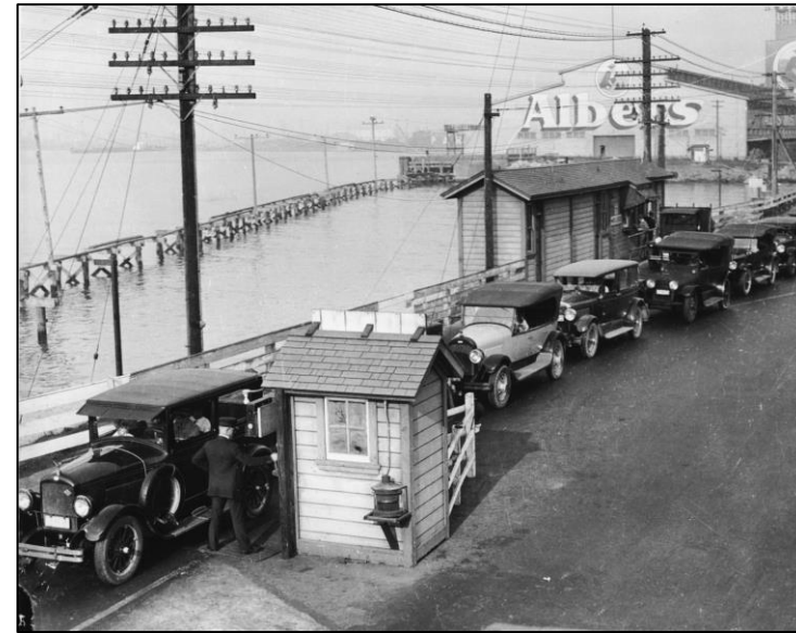
Sneaky Buster also filmed ferry scenes for Day Dreams in Oakland (above) and two cable car stunts in Hollywood near his studio, below left at 6665 Santa Monica Blvd. and along Sunset Blvd. while crossing Cahuenga below right.