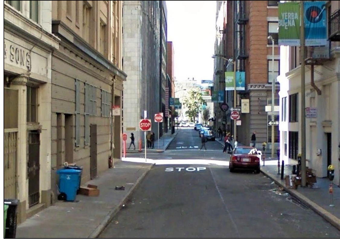
(Eight) At the same spot now looking west, the police chase Buster down Minna away from the camera.