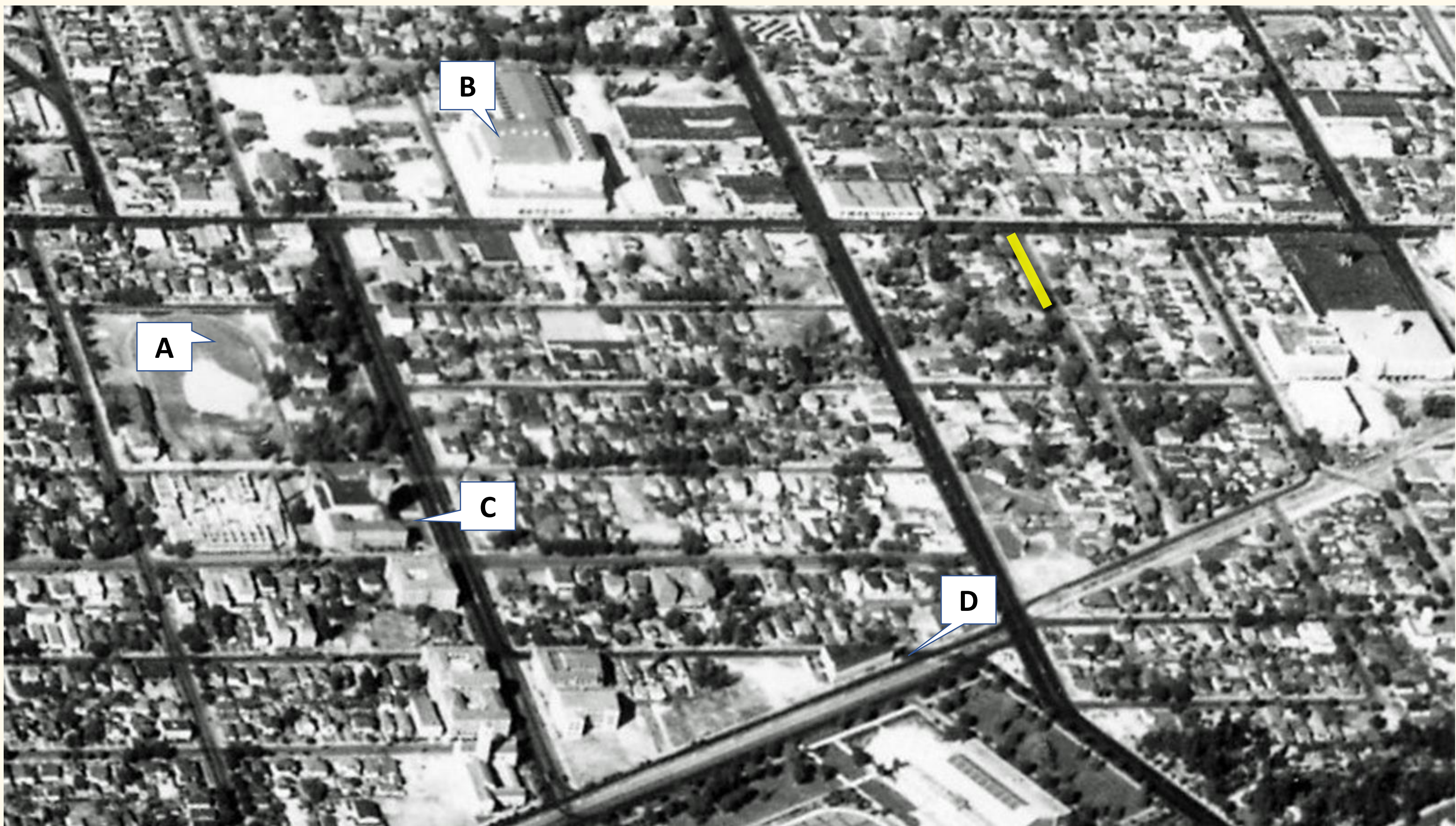
Looking north: (A) former Bovard Field at USC, frequently used in movies, where Keaton filmed football scenes for Three Ages and baseball scenes for College , and where Lloyd filmed football scenes for The Freshman , (B) Shrine Auditorium, (C) Bovard Hall, beside which Keaton filmed Seven Chances , and (D) former USC College of Dentistry Building, the triangle building north of Exposition Park Keaton used for a joke in Cops .